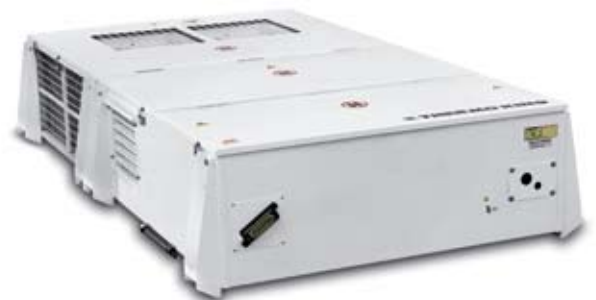
Tramway type of unit