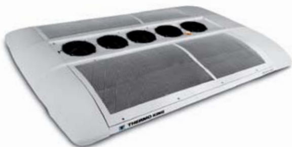
Low profile saloon unit for metro applications