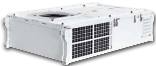
Tramway type of unit