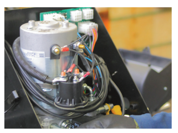
LOW NOISE POWER UNIT & NO ELECTRONICS = EASY MAINENANCE